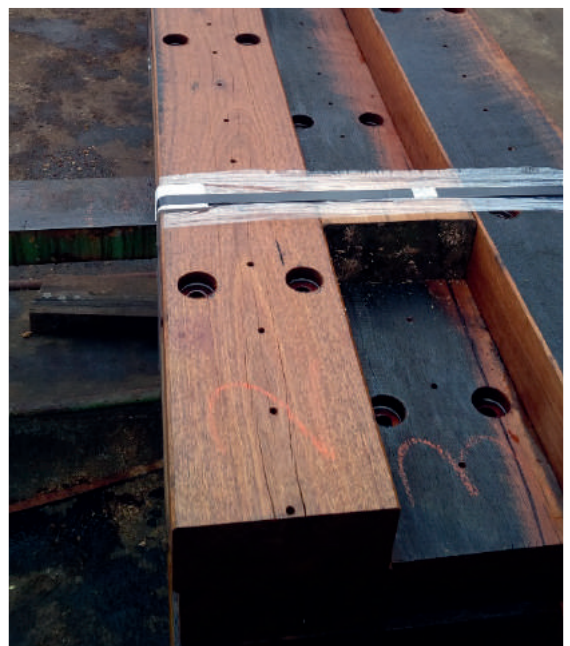
QLD Spotted Gum 200 x 75 Pre-drilled Bridge Decking

Sentinel also offers their in house machining and profiling service. Large section timber up to 300 x 300 can be dressed by our up to date machining facility. Bollards and tree guards with profiled tops, bridge decking requiring de-arising and pre-drilling ready for speedy install.