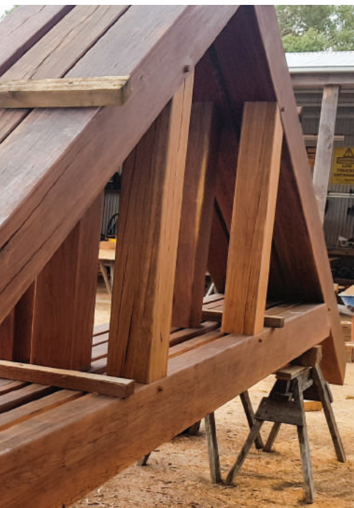
Heavy traditional Truss – 200 x 200 QLD Spotted Gum