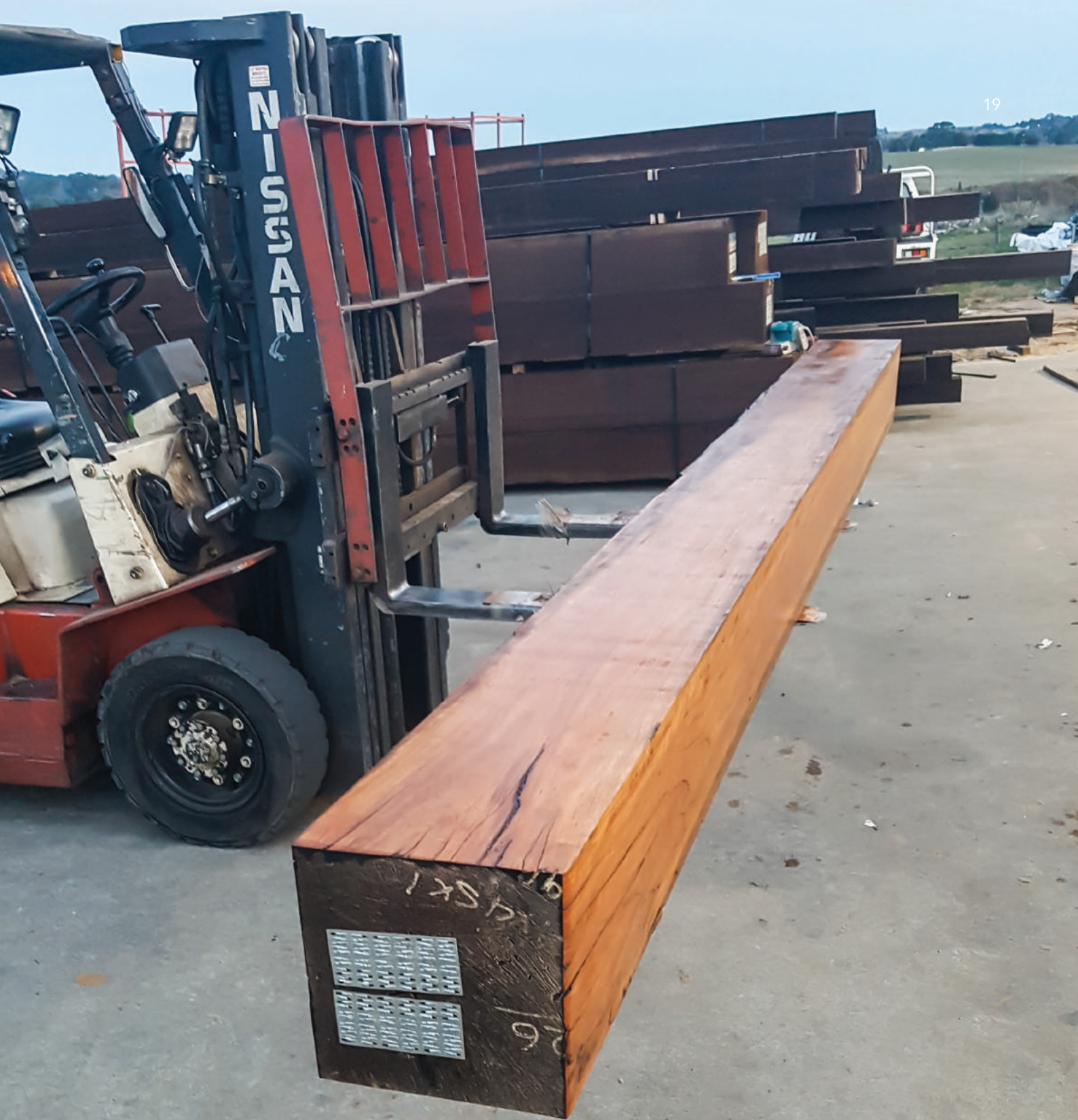
Special Order Dressed QLD Spotted Gum 350 x 400 x 7000 beam being pre-oiled