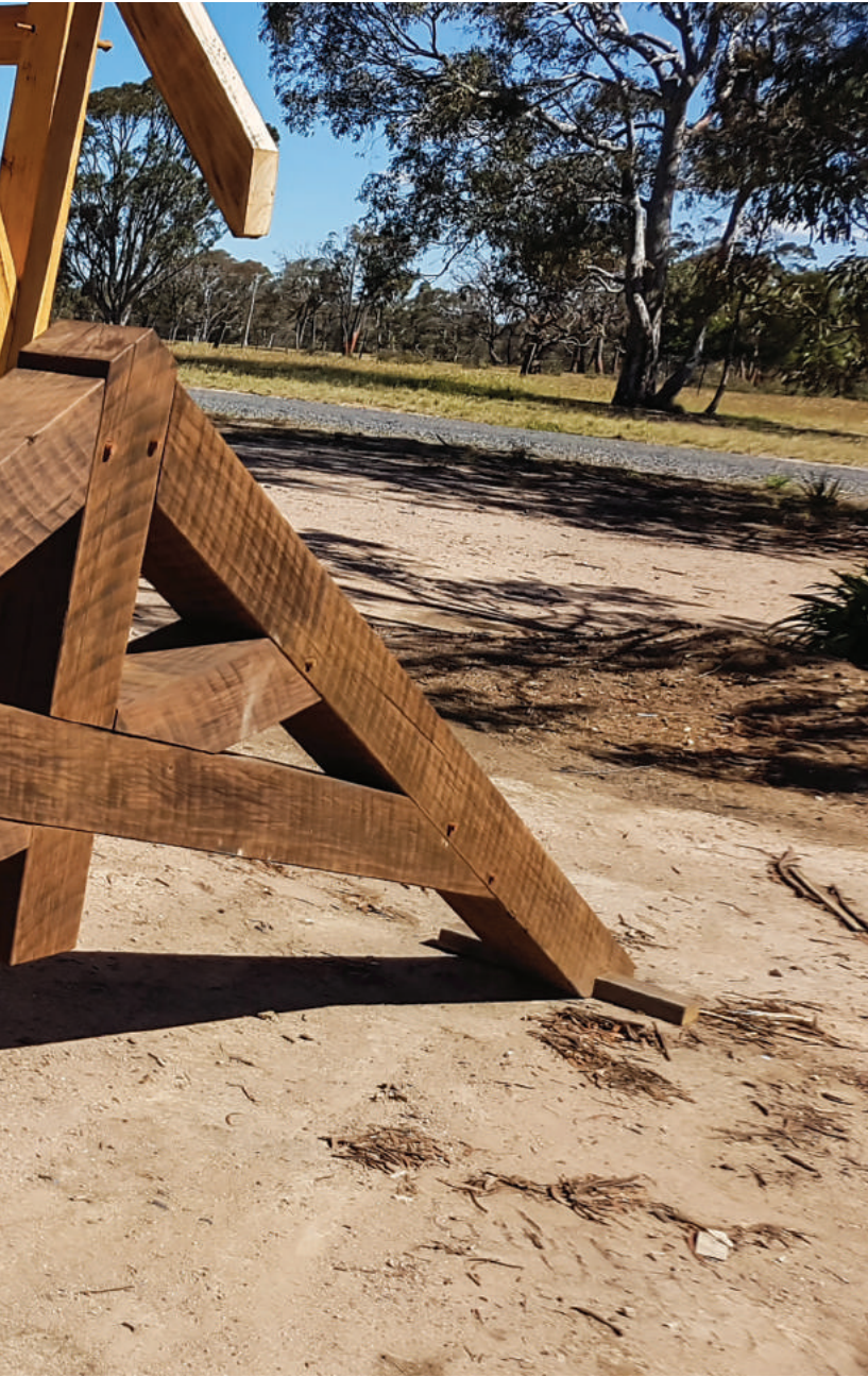
Scissor Truss – QLD Spotted Gum ex 200 x 200