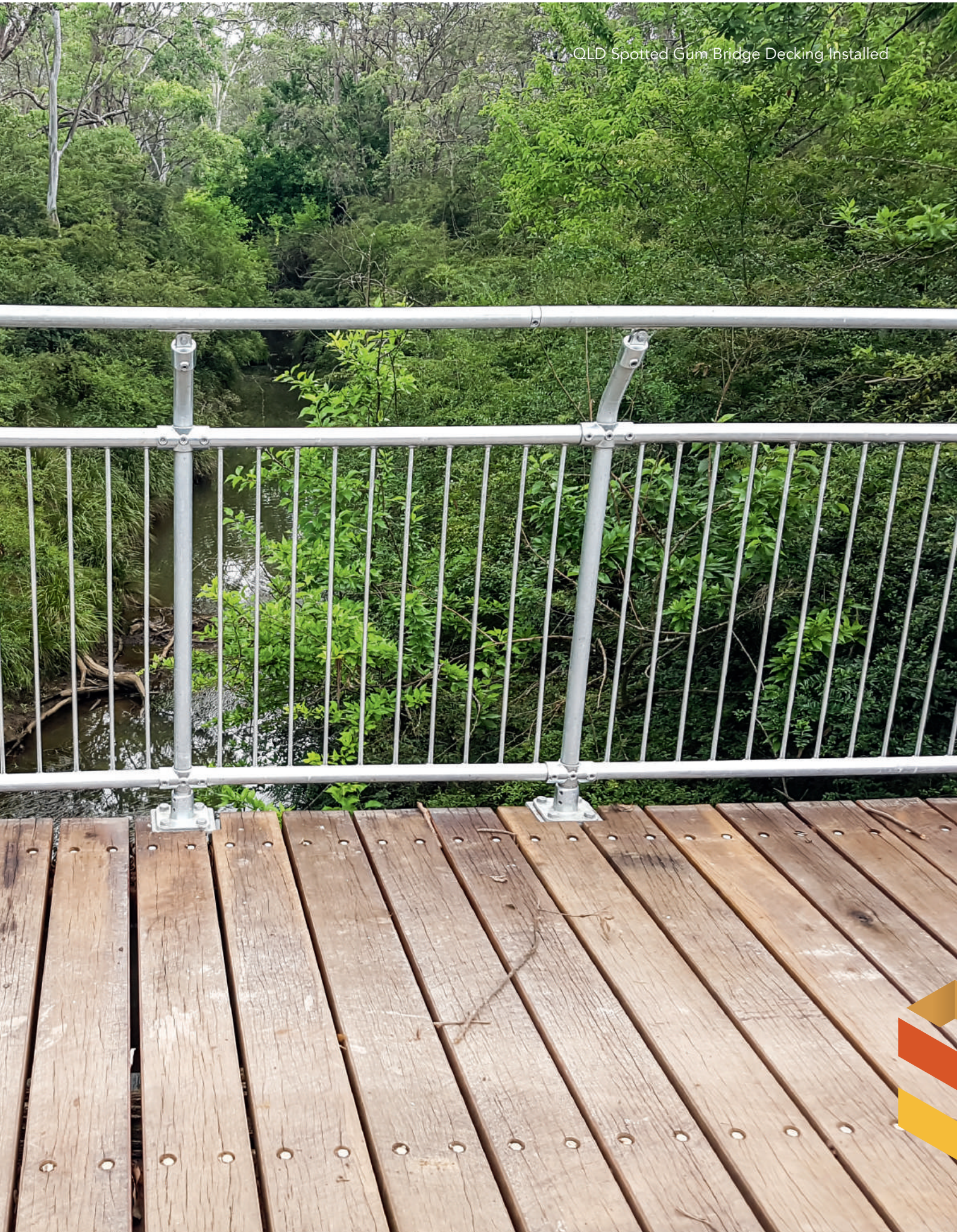
QLD Spotted Gum Bridge Decking Installed